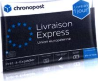
Enveloppe CHRONOPOST “Union Européenne” 2Kg

Applicants from Portugal and the Azores are required to bring to their visa interview a Chronopost envelope size 2kg for “European Union.” This envelope can ONLY be purchased at a French Post Office. Below is a map and directions to the French Post Office that is nearest to the U.S. Embassy in Paris.